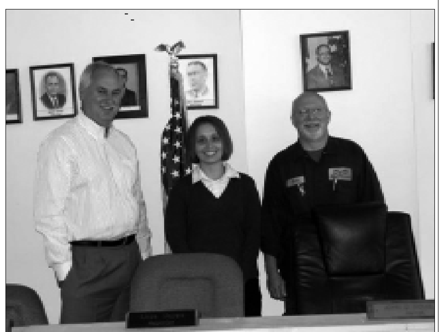
The town of Cumberland Gap closed a $5,000 Highway Safety Grant Anticipation Note.

See us for your special projects needs. (615) 255-1561