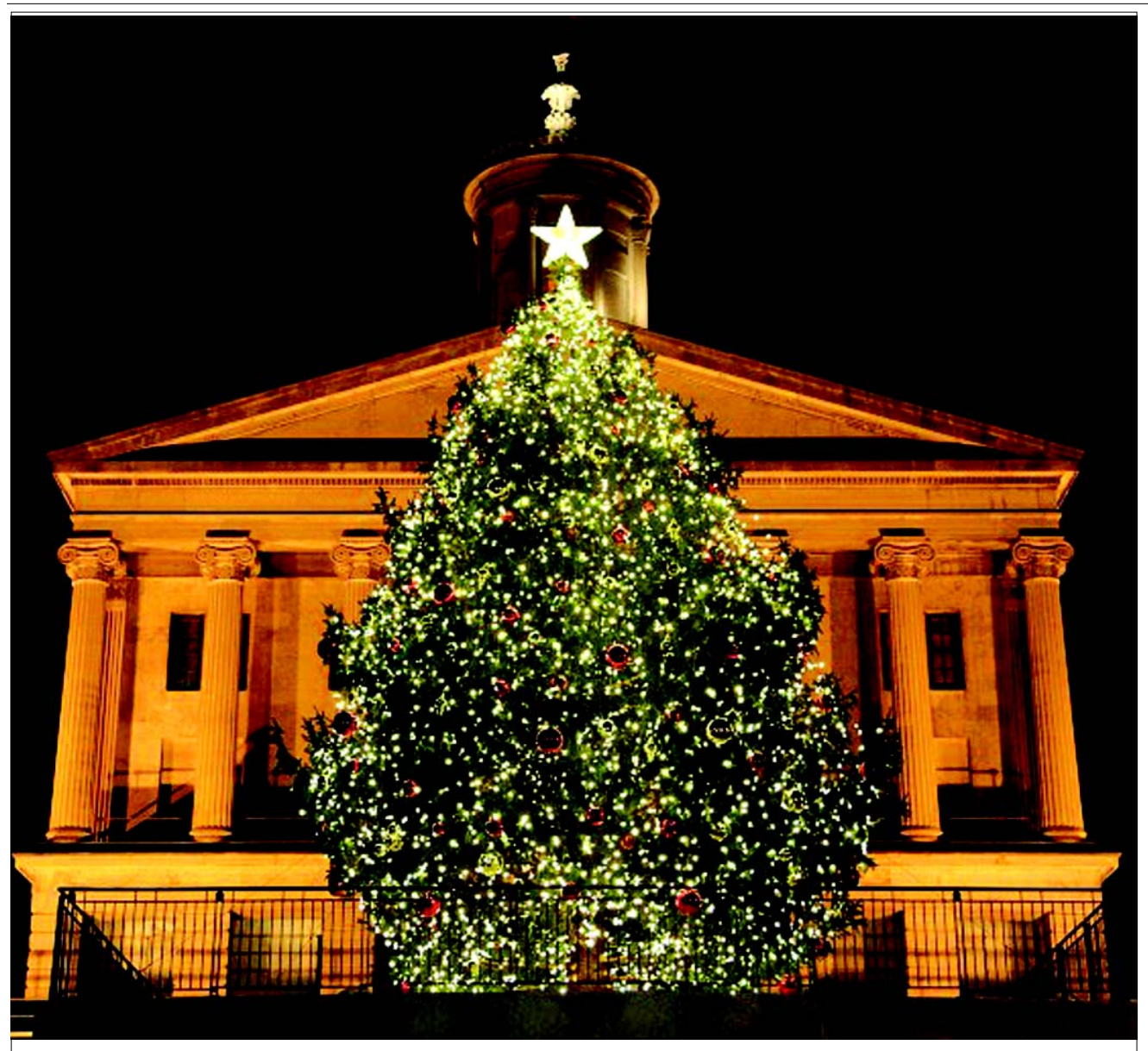
The state Capitol decked out in Holiday style.