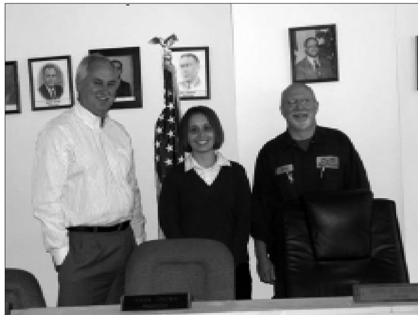
The town of Cumberland Gap closed a $5,000 Highway Safety Grant Anticipation Note.