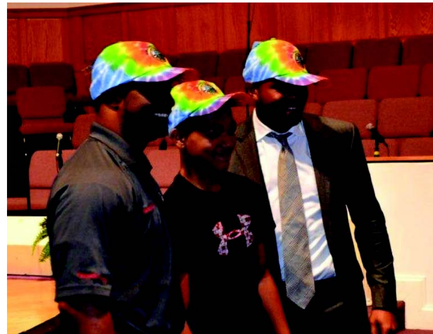
The Chattanooga Gang Task Force "Future is Ours" initiatives include recreation center scholarships to UTC sponsored by successful business leaders from the Chattanooga area, who are willing to serve as positive role models for local teens.

To learn more about the Comprehensive Gang Model, visit the National Gang Center website at www.nationalgangcenter.gov