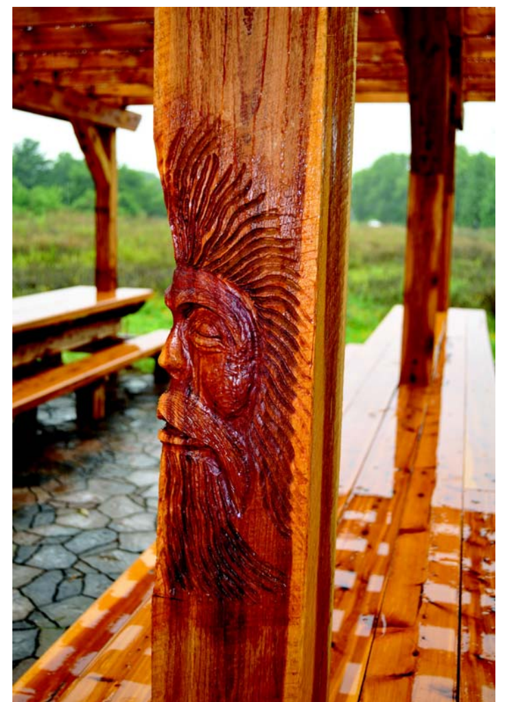
The Eastern Red Cedar Pergola features spacious tables, stone pavers, a vined canopy and hand carved post.

As a result of the wetlands project, Athens has been able to restore six acres at the library and will continue to use the facility for education and enjoyment by the community for years to come.