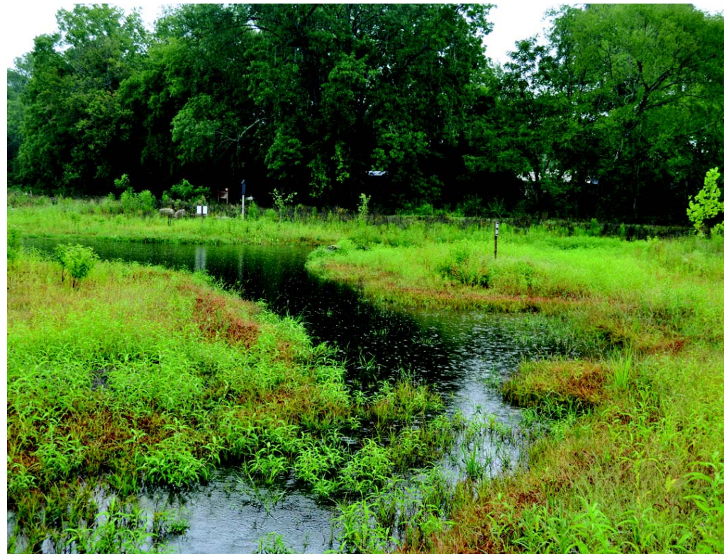
The wetlands restoration project included many ecosystems, such as wetlands, glades, riparian zones, stream banks, barrens, and meadows.

land. While wetland maintenance activities and education efforts continue, the majority of the public has now embraced the concept of wetlands and the important role they play in our lives.