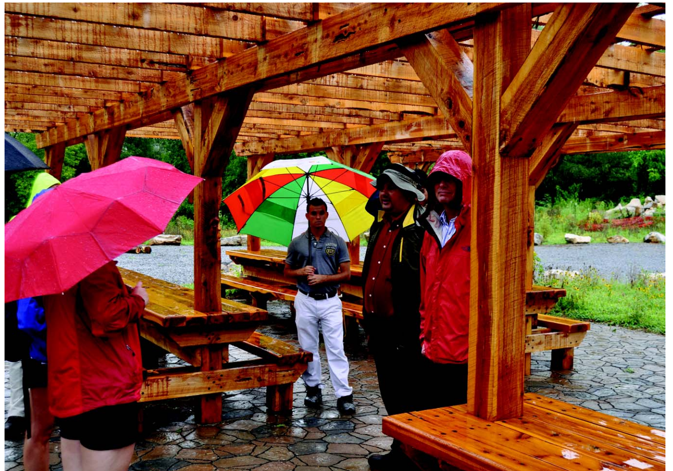
To further enhance the wetland area, Athens also added an Eastern Red Cedar Pergola.

This group gets even smaller as children, grandchildren, and scouts visit and go home to tell family and others what they learned at the Wet-