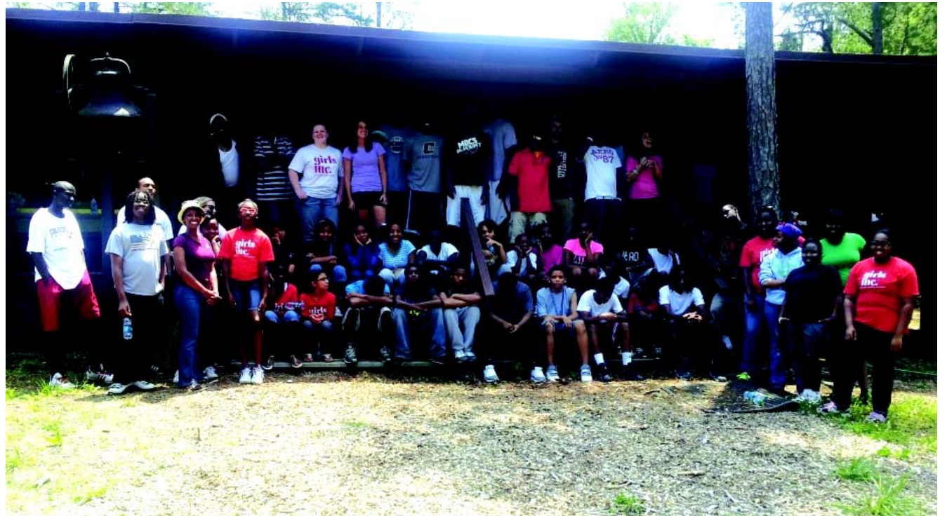
The first assignment for Chattanooga's Youth Empowerment Committee was a group camp site cleanup. Teens, who are finding their voice through the committee, recently helped plan and execute a successful community event and rally, Be the Change at Miller Park.

"The Stars of Chattanooga program was developed to use music to