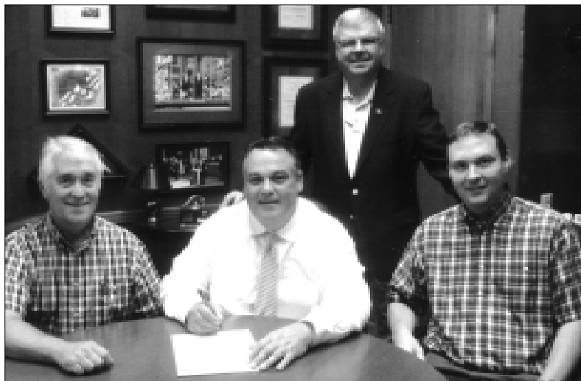
The city of Dyersburg closed a $4.5 million loan to use on various municipal projects.