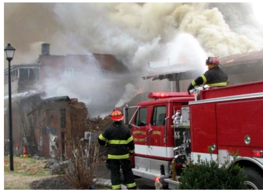
The Greeneville Fire Department responding to a residential fire. In Tennessee last year, fire departments responded to 28,187 fires with 9,901 of those fires occurring inside buildings.

"If you're in a fire, and don't have two ways out, you probably have a 50/50 chance of getting out," said state Assistant Fire Commis-