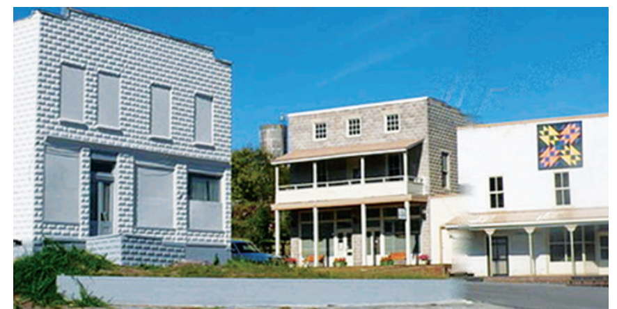
Bulls Gap Town Square was once the site of the old central railroad station. Today, the site serves as a popular stopping point, where passengers riding the old railroad steam engine from Bristol, disembark, eat box lunches, listen to Bluegrass and tour the town's two museums, one dedicated to the city's native son, Hee Haw comedian Archie Campbell.

In Bulls Gap, town leaders are strategically building economic vitality for the community upon the town's rich railroad heritage; they have successfully preserved the past—while ensuring a modern and viable future through effective planning and services.