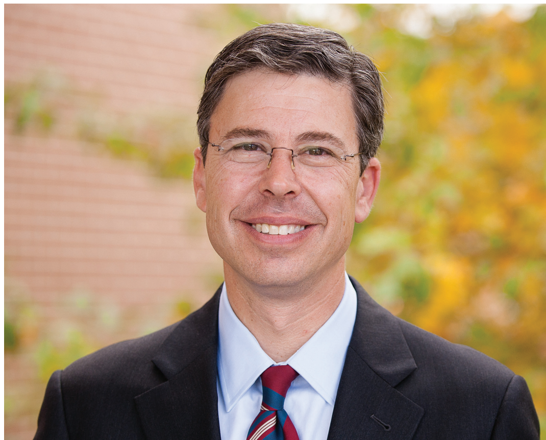
Chattanooga Mayor Andy Berke

TT&C: You served in the State Senate before you were elected mayor in 2013. Can you share some lessons you learned in the