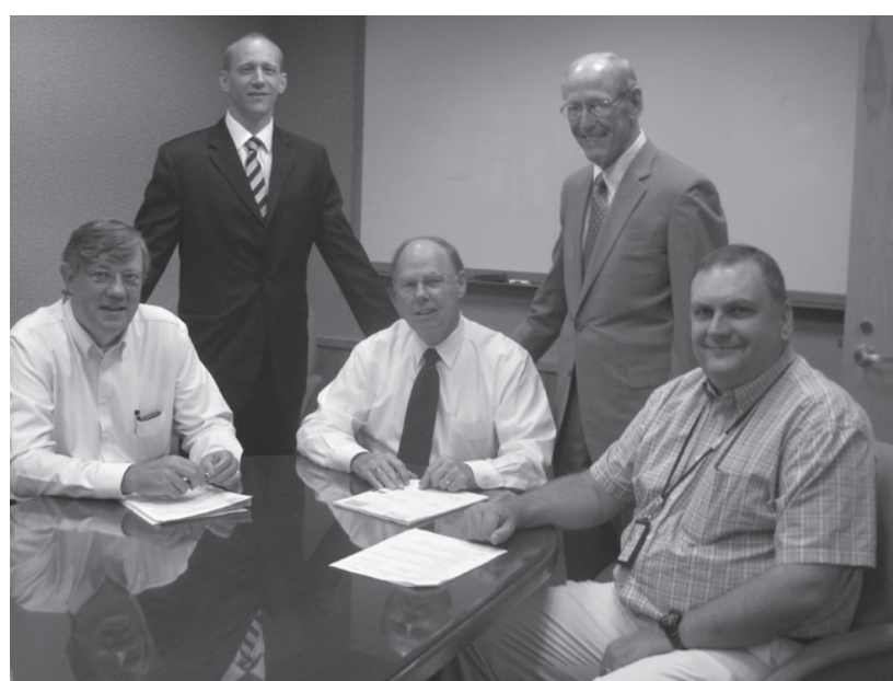
The city of Morristown closed a $20 million loan for sewer system upgrades.