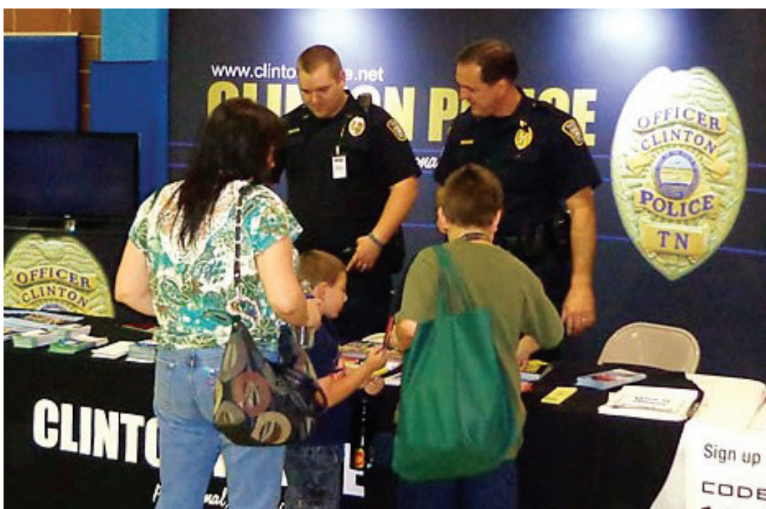
Clinton Police officers provide information to citizens at the city's recent Emergency Management Fair. The department provides training to schools and other police agencies throughout the region.

A culture of planning, caring and excellence; it's what takes a municipal Police Department from ordinary to outstanding. And the Clinton Police Department is all that. A model of efficiency and outreach, officers, several with advanced specialty degrees, strive to provide the utmost in community service and training to area schools and other agencies, while being