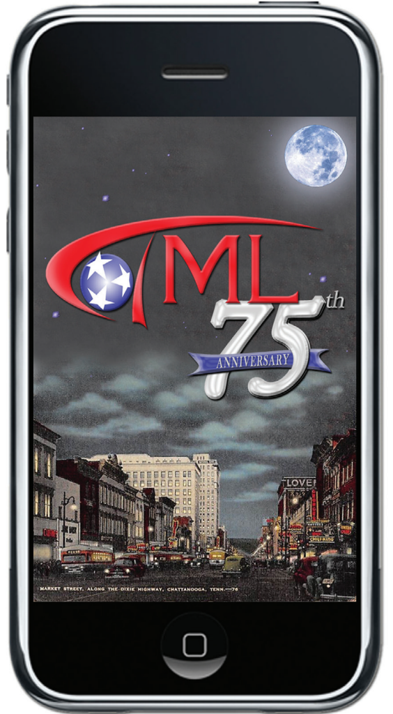
Improve your conference experience with this easy to use free mobile app.

Sponsors. TML Sponsors help underwrite some of the conference expenses, as well as support us in the daily work of representing Tennessee's municipalities. In this section, you can learn more about our See TMLAPP on Page 3