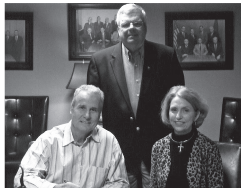
The city of Ripley closed a $1 million loan for a new fire hall and equipment.