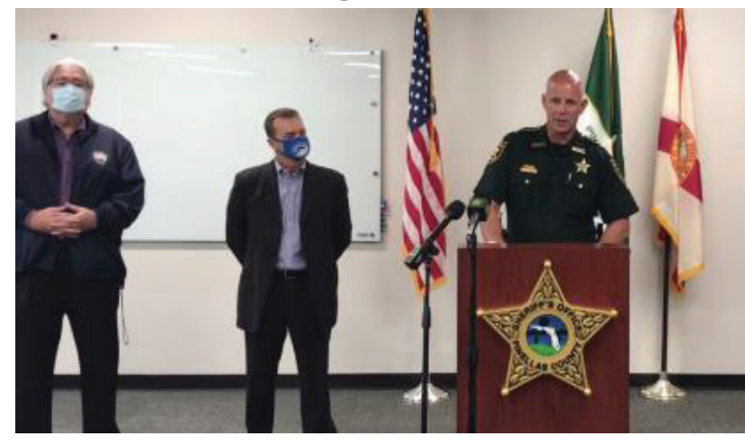
The cyberattacker used remote access to toggle levels of sodium hydroxide at a water treatment plant near Tampa, but an operator at the facility quickly fixed the problem, officials said.

Sodium hydroxide—otherwise known as lye-is used to control acidity and remove metals from drinking water, but it's also the main ingredient in liquid drain cleaners and can be lethal if ingested in large