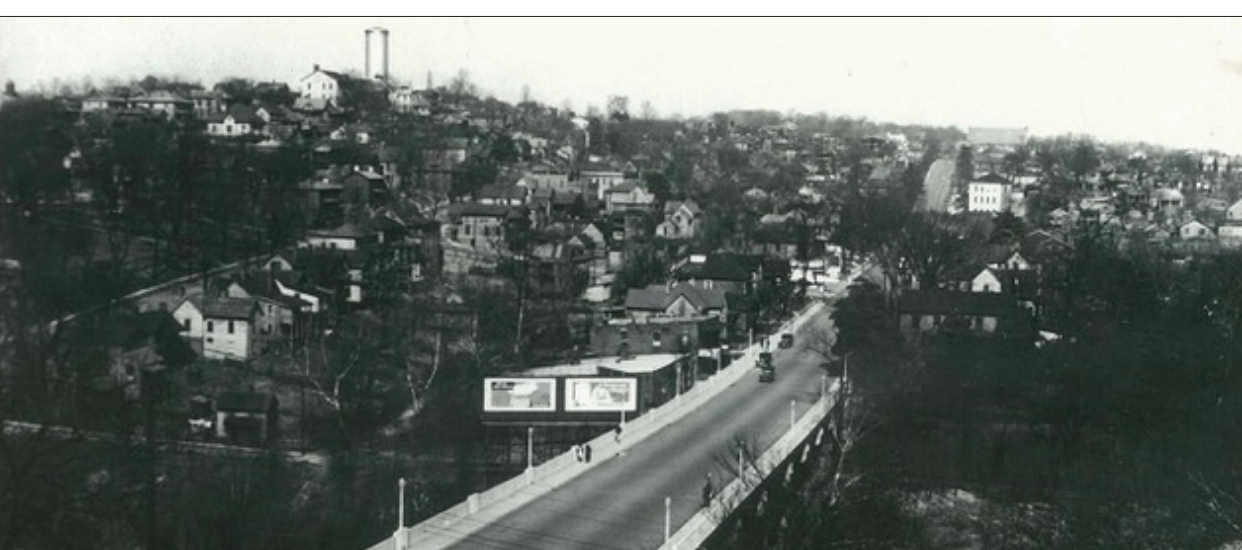
The Mountain View neighborhood was once home to a thriving neighborhood of middle class homes, businesses, and churches. It was one of three majority black-owned neighborhoods that was lost to urban removal. Photos from Knoxville's Beck Cultural Exchange Center document how these areas looked both before and after urban removal projects.

The new task force will work with agencies already active in the city to address gaps and barriers as well as meet certain benchmarks including reducing the poverty